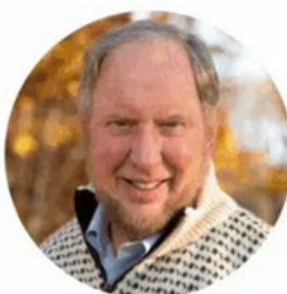
Robert D. Putnam

Together, these keynote speakers will offer fresh insights, challenge assumptions, and set the intellectual tone for a conference that aims not only to analyse social capital, but to advance how it is understood and applied in practice.